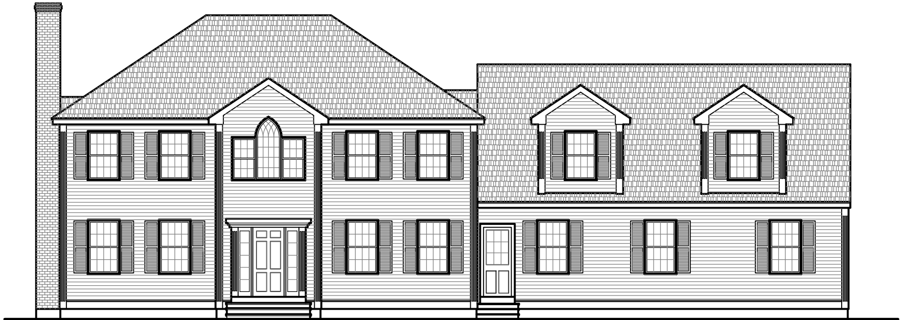
FRONT ELEVATION PLAN # 3340