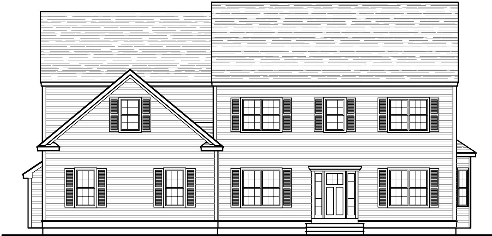
○ FRONT ELEVATION PLAN # 3480