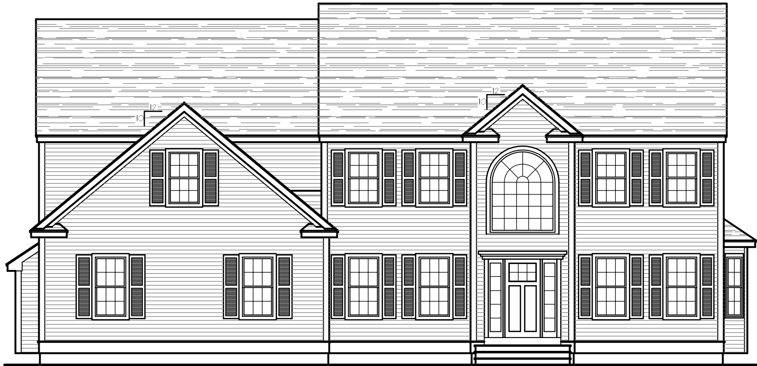
○ FRONT ELEVATION PLAN # 3534