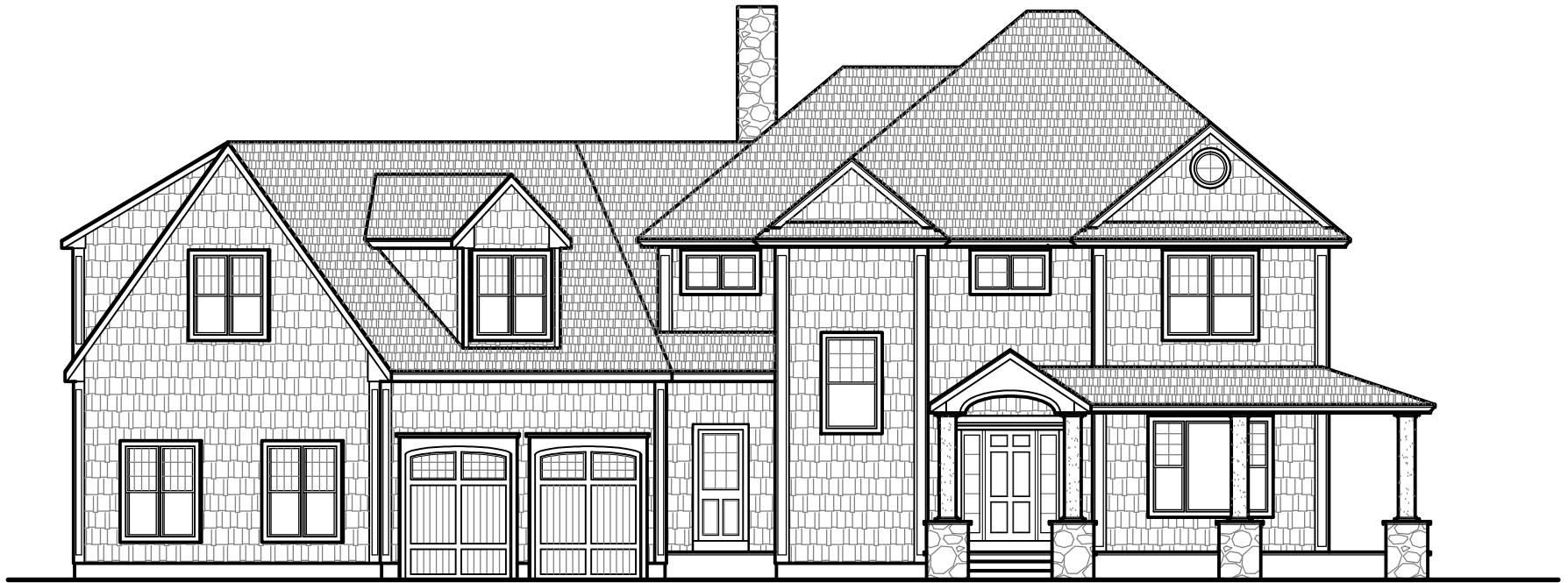
○ FRONT ELEVATION PLAN # 3574