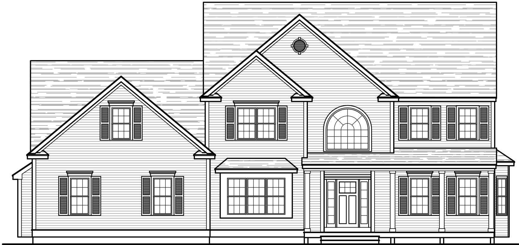
FRONT ELEVATION PLAN # 3613